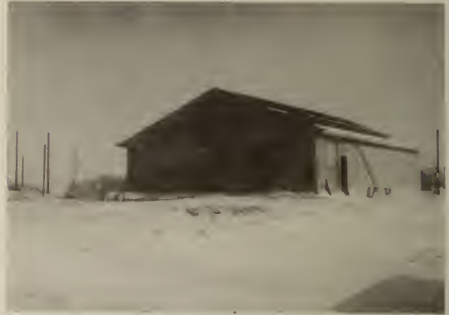
THE WAREHOUSE AND OFFICE SHOWROOM IS NOW CLOSED IN FOR INSIDE FINISHING.

This spring U.F.A. Co-op plans to open their 12th Farm Supply Centre at Provost. Progress is steady and the people of Provost are eagerly awaiting our new centre.