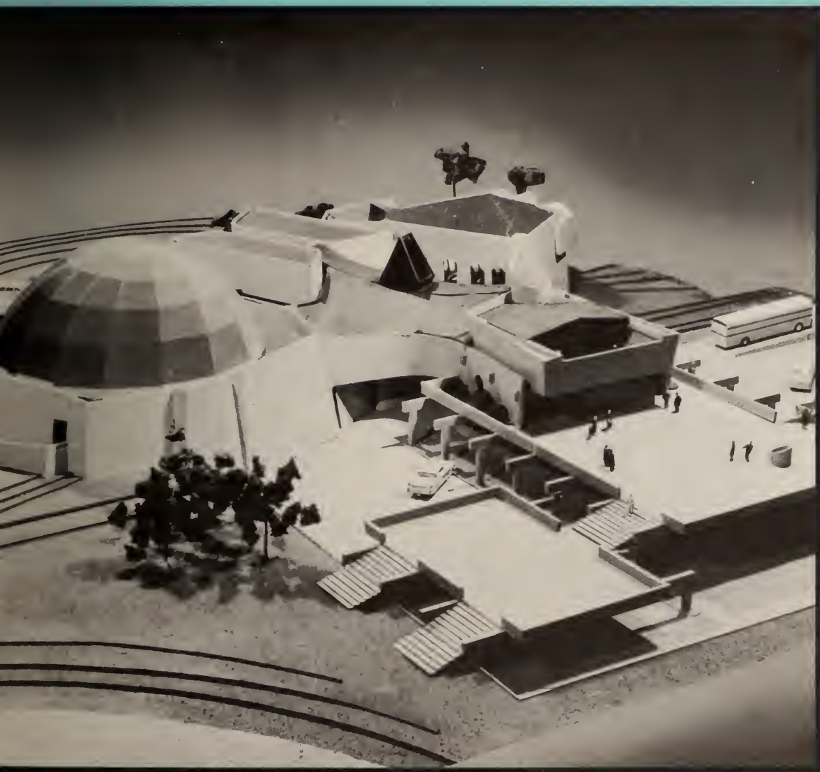
CALGARY AND DISTRICT CENTENNIAL PLANETARIUM